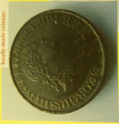
George III, half stiver of Ceylon, dated 1815. Minted in England - this date only - to replace locally-made coinage.