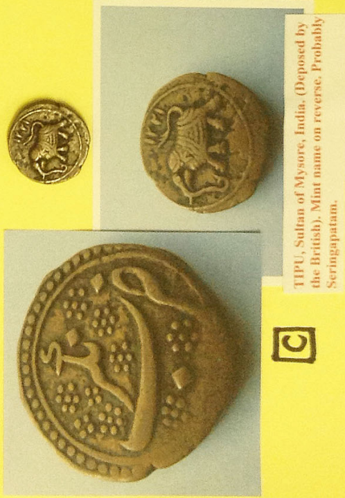
TIPU, Sultan of Mysore, India. (Deposed by the British). Mint name on reverse. Probably Seringapatam.

Elephant coins ... ... a 'Jumbo' challenge!