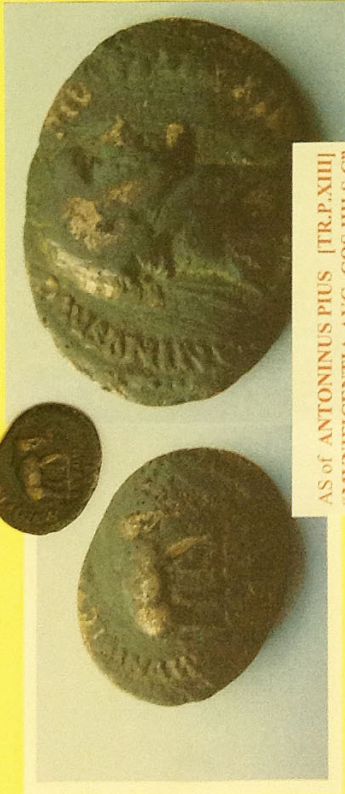
AS of ANTONINUS PIUS [TR.P.XIII] "MVNIFICENTIA AVG. COS III S C"