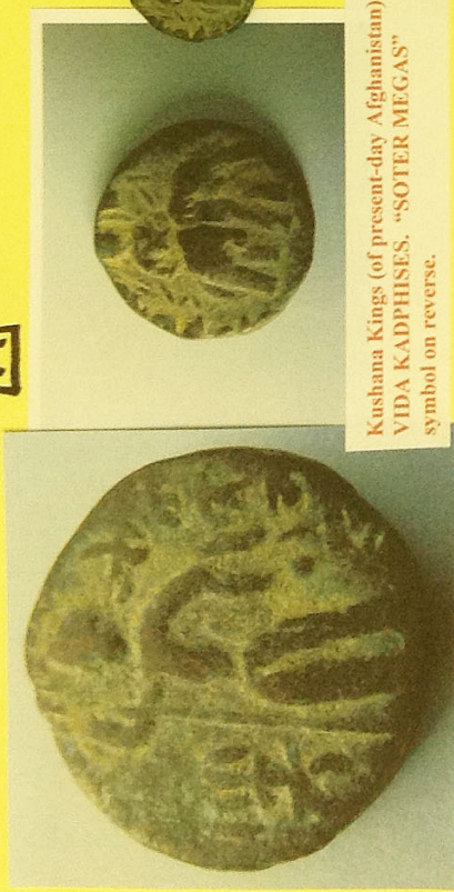
Kushana Kings (of present-day Afghanistan) VIDA KADPHISES. "SOTER MEGAS" symbol on reverse.